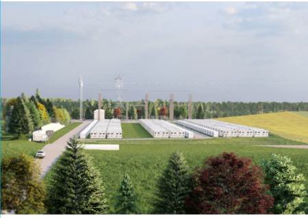
*Renderings provided by Aypa Power