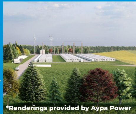
*Renderings provided by Aypa Power

JOIN US! Saturday, July 20th | 10:00am - 1:00pm & Thursday, July 25th | 5:00pm - 8:00pm @ SNGRDC Boardroom: 2498 Chiefswood Road, Ohsweken Investment Review will be recorded and available for viewing online Visit www.snfuture.com for more information or to submit questions